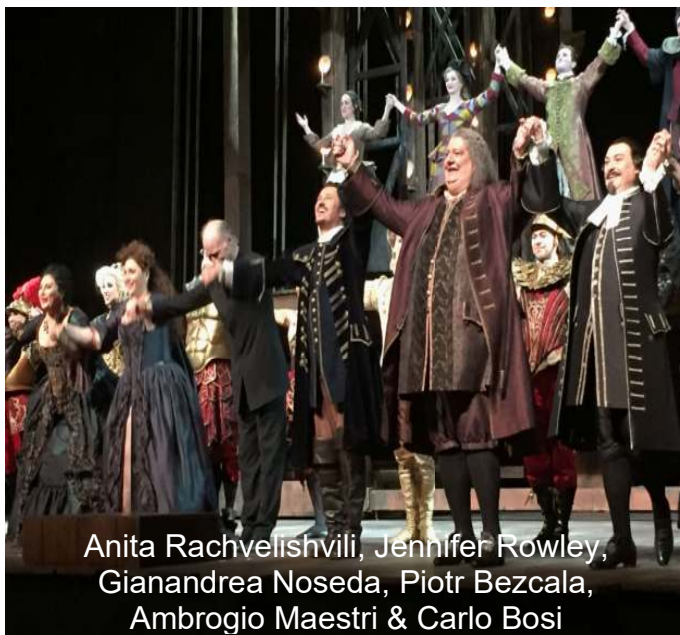
Anita Rachvelishvili, Jennifer Rowley, Gianandrea Noseda, Piotr Bezcala, Ambrogio Maestri & Carlo Bosi