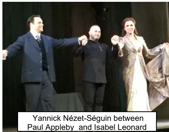
Yannick Nézet-Séguin between Paul Appleby and Isabel Leonard

Based on what is described as a symbolist play by the Belgian playwright Maurice Maeterlinck, this was Debussy's only completed opera. The music is highly atmospheric, with no conventional arias. In an interview posted on the Met website, Mr. Nézet-Séguin explains his goal as to make it as engaging and alive as possible. He describes it as delicate music with a million colours, speaking directly to the emotions, and explains how the combination of listening to what the orchestra is telling with the delivery of the incredible cast can really reach the heart and imagination of the audience. Debussy's music creates a