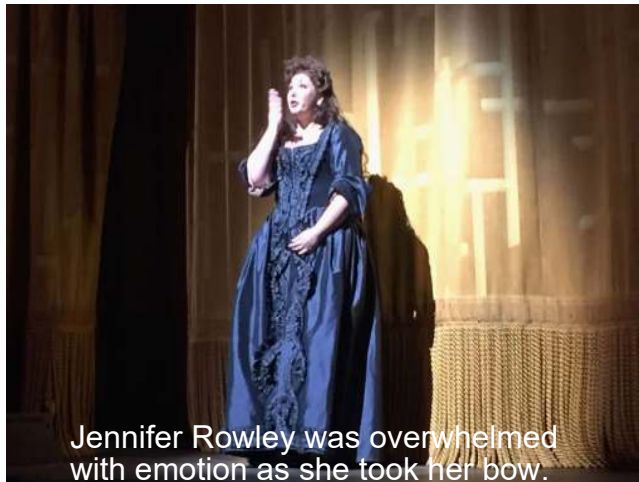
Jennifer Rowley was overwhelmed with emotion as she took her bow.

performance it was evident that she had lived every emotion with Adriana. Apart from the three principal singers, I'd like to add a word about Ambrogio Maestri in the role of Michonnet. Mr. Maestri is a delightful larger than life presence, also seen at the Met in the title role of Falstaff and as Dulcamara in L'elisir d'amore , but this role was different. Michonnet is a fatherly figure who loves Adriana. Although love has passed him by, he is a faithful and loving friend to Adriana and Mr. Maestri brought an affectionate poignancy to the role.