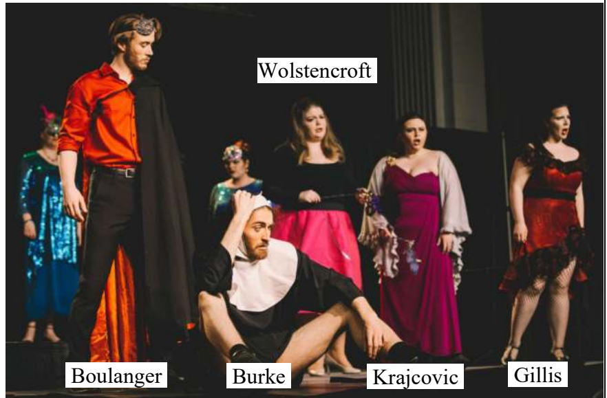
Rehearsal Photo