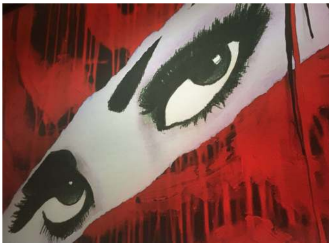
The magnificent screen adorning the pre-performance stage

The brief life of Marie Duplessis, the real-life inspiration for both Marguerite of the novel and play and Violetta of the opera, ended in 1847, just a year before Dumas's novel appeared. Born into a humble family in Normandy, she went to Paris to make her own way in life. She inhabited what was known as the "demi-monde", a particularly French social group between the aristocracy and the lower classes. She hosted a salon, a gathering place for writers, politicians and artists where wit and conversation flourished. She is believed also to have had an affair with the composer Franz Liszt. Like the Violetta we know and love, she was greatly admired, holding court among rich and powerful men who could never invite her into high society.