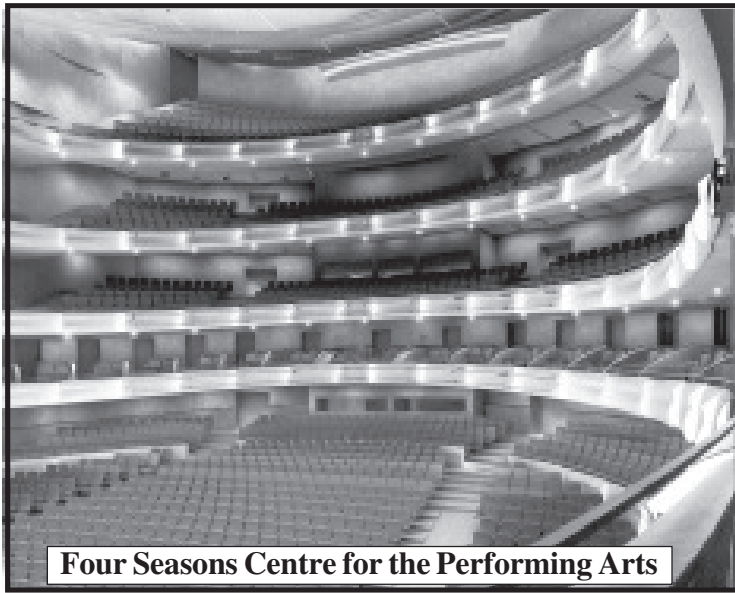
Four Seasons Centre for the Performing Arts